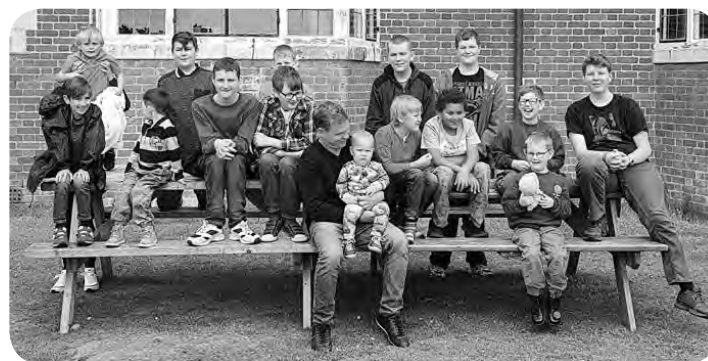
Barth boys enjoying a chance to sit down during a busy Activity Weekend