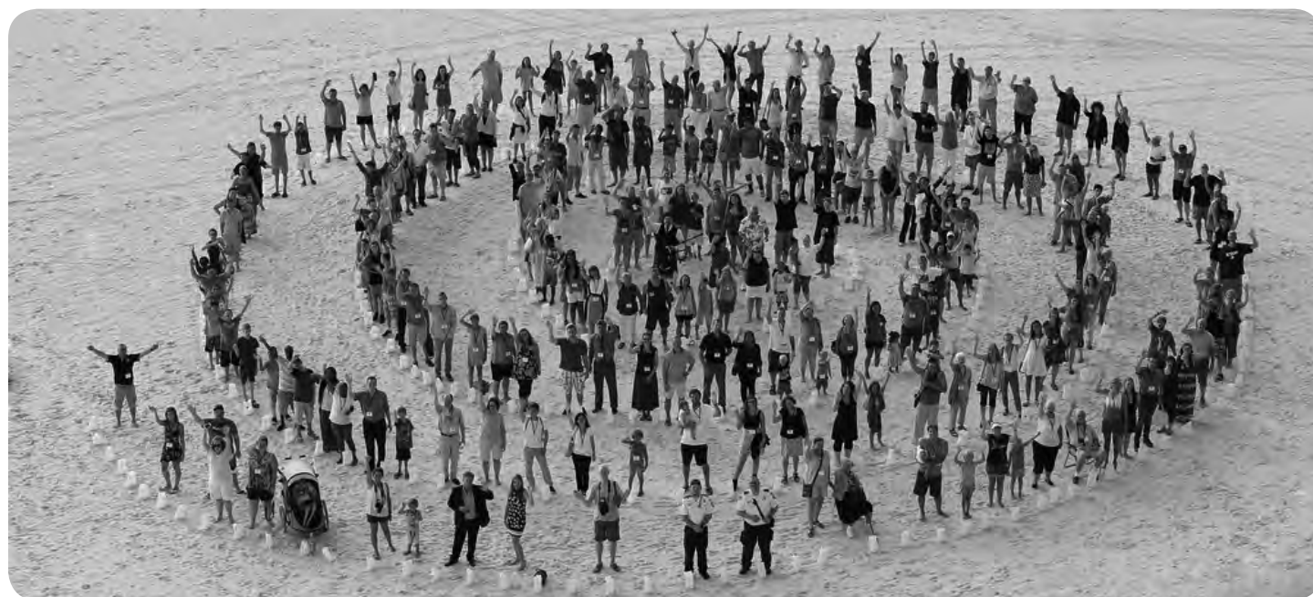
Conference attendees at BSF's 2016 conference

As the 2018 BSF conference approaches, why not come and share in the knowledge, experiences, and love that this unique community possesses.