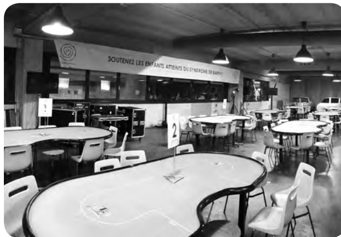
Setting up for the Barth Poker Tournament

As this was meant to be one of our "Big Barth Weekends," at the same time, a fireman friend of ours and team member of