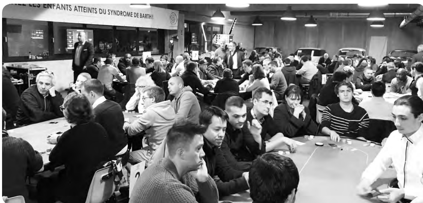
Attendees at Barth Poker Tournament